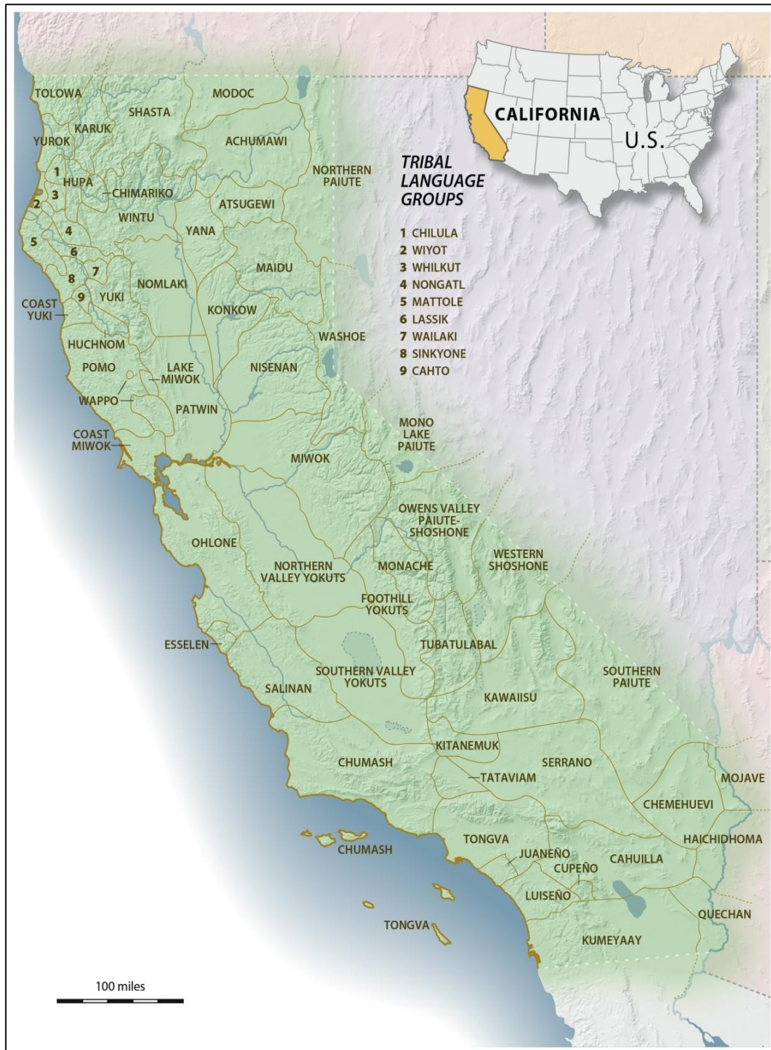
Tribal language groups at the time of Spanish colonization

Map by Doug Stevens/Flyboy Graphics.