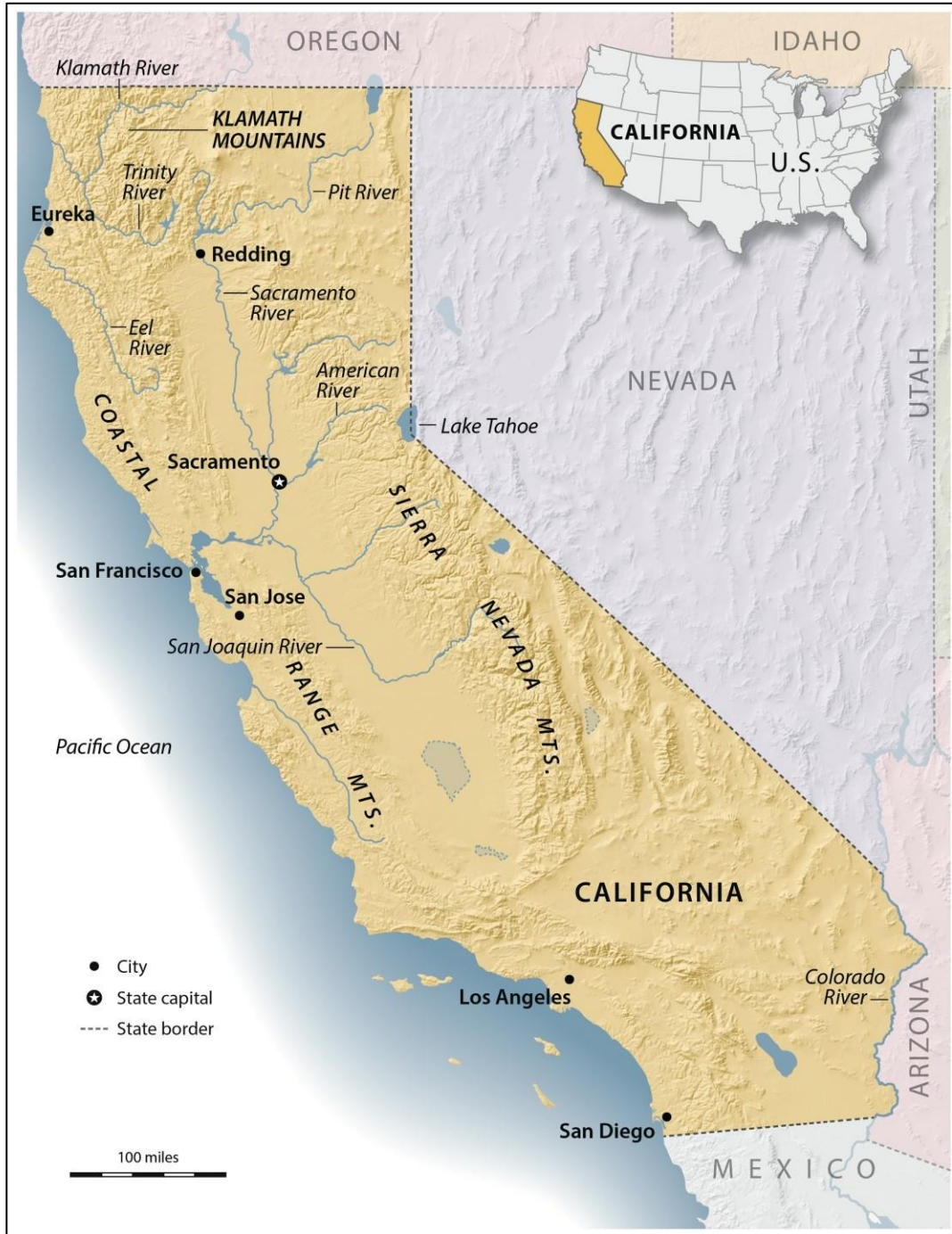
Present-day geography of the state of California

Map by Doug Stevens/Flyboy Graphics.